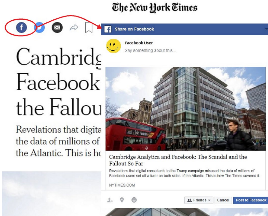
Figure 1. An Example of a Facebook API as Depicted on the New York Times