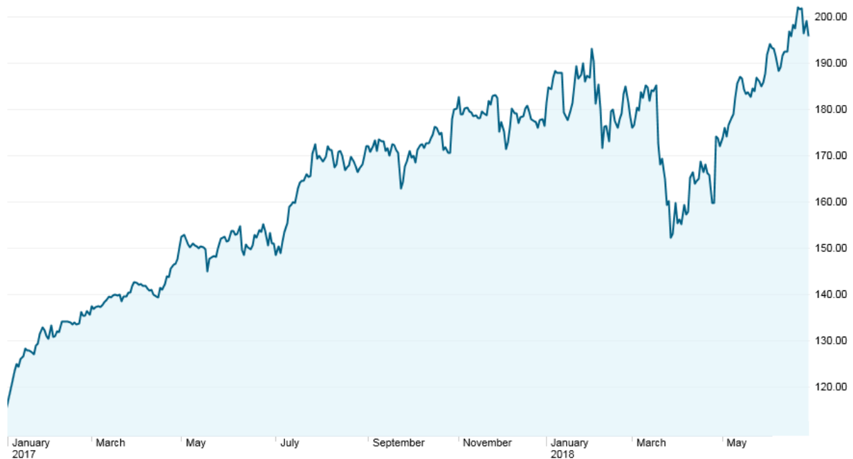
Figure 3. Facebook per Share Price (USD) since January 1, 2017